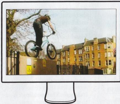
Inspired Bicycles - Danny MacAskill Astonishing tricks from Danny MacAskill, an Inspired Bicycle stunt rider. 10,202,188 views