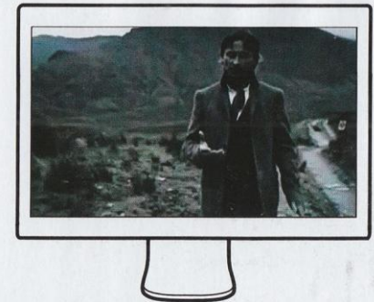
Johnnie Walker - The Walk Robert Carlyle fronts this impressive story of Johnnie Walker whisky. 53,546 views