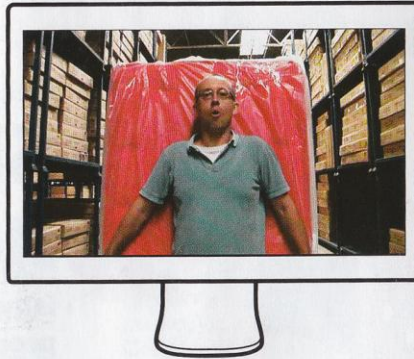
Bensons for Beds - Mattress Dominoes Cheap marketing at its best. Get your employees to fall over. 659,322 views